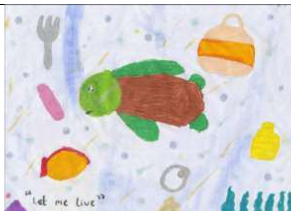
This primary pupil, Sam, 8, pictures a turtle in a sea of waste.