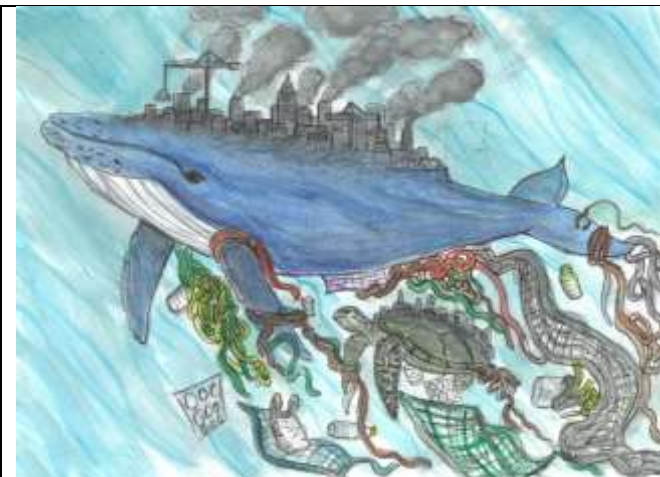
Bella, 13, pictures the impact of climate change on the whale and turtle. She asks: can the religions of the world do more to repair the damage we have caused and save the planet?'