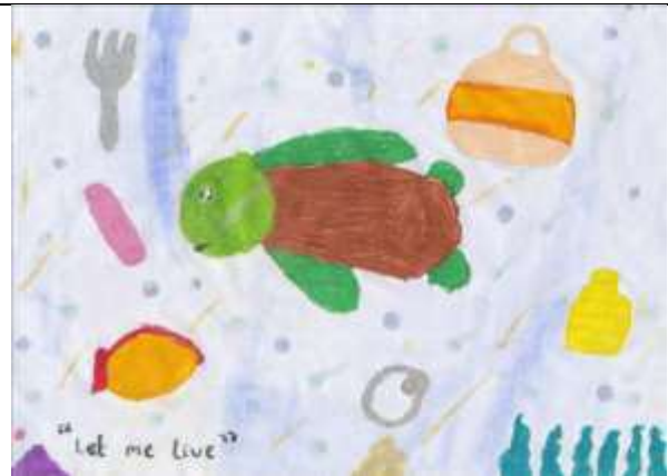
This primary pupil, Sam, 8, pictures a turtle in a sea of waste.

Thanks to Luton SACRE, the Westhill Trust, NASACRE and RE Today for the resources and opportunities represented in this plan. Suitable for 9-11s and for 11-14s (teacher can adapt the activities and resources to challenge their pupils appropriately)