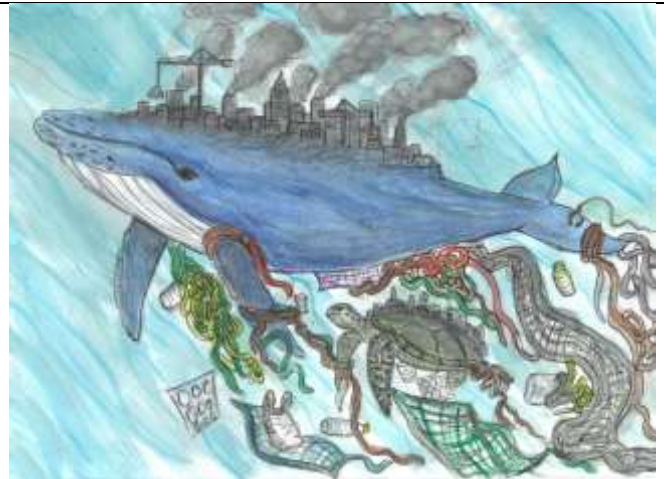
Bella, 13, pictures the impact of climate change on the whale and turtle. She asks: can the religions of the world do more to repair the damage we have caused and save the planet?'

Key Question: Green religion? How and why should religious communities do more to care for the Earth? A unit plan for education in religion and worldviews focusing on climate, natural world and justice.